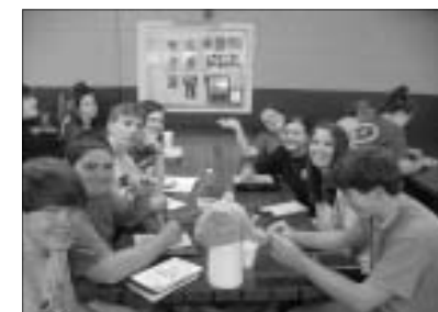
Special Friends for Life