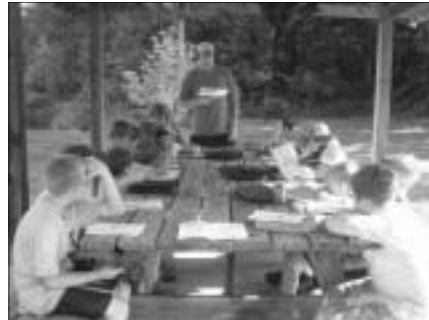
Interesting Bible Classes

The camp permits campers ages 8 to 18. Children of staff members are sometimes allowed at a younger age. Contact the Director of the week you want your child to come if your child is younger than age 8.