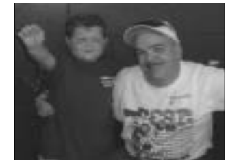
Special Awards for Special People